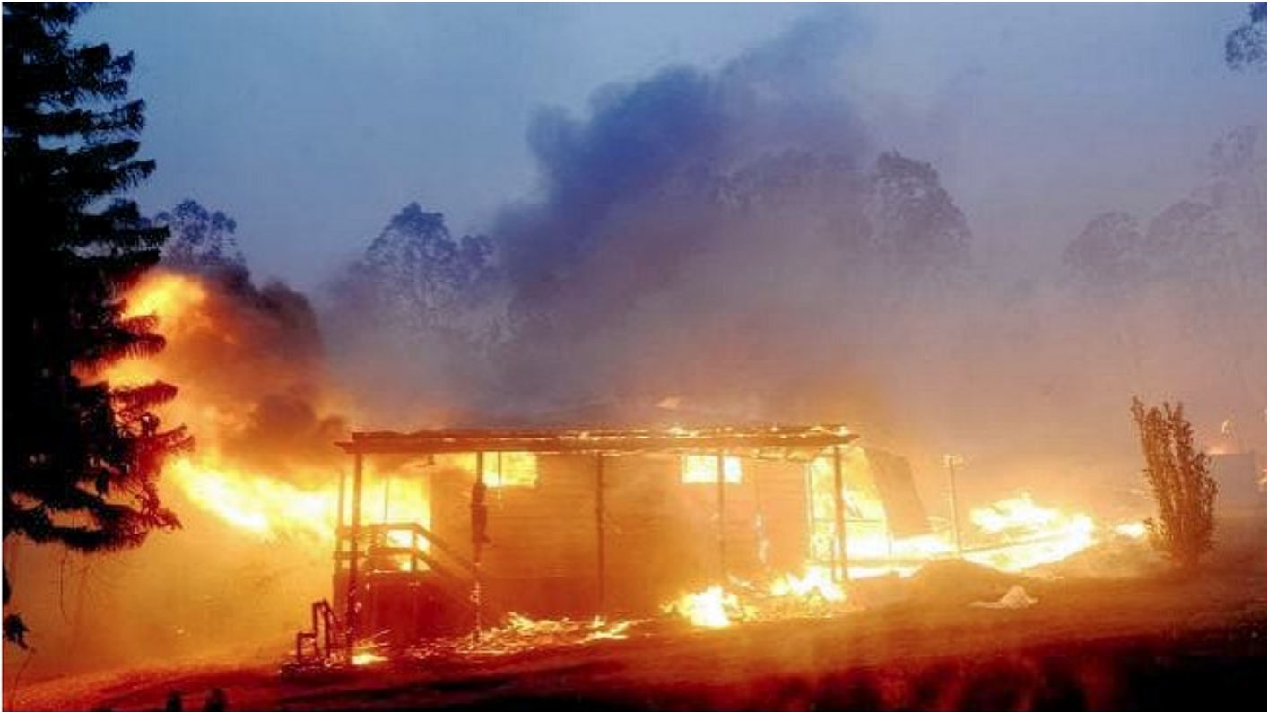
Above: Residents and firefighters face a bushfire that has threatened homes and lives in Rainbow Flats on NSW North Coast. One of hundreds of fires across all states. Below: Firefighters battling fires in Taree.

Our thoughts are with thousands of people struggling to stay alive in these fierce fire storms.